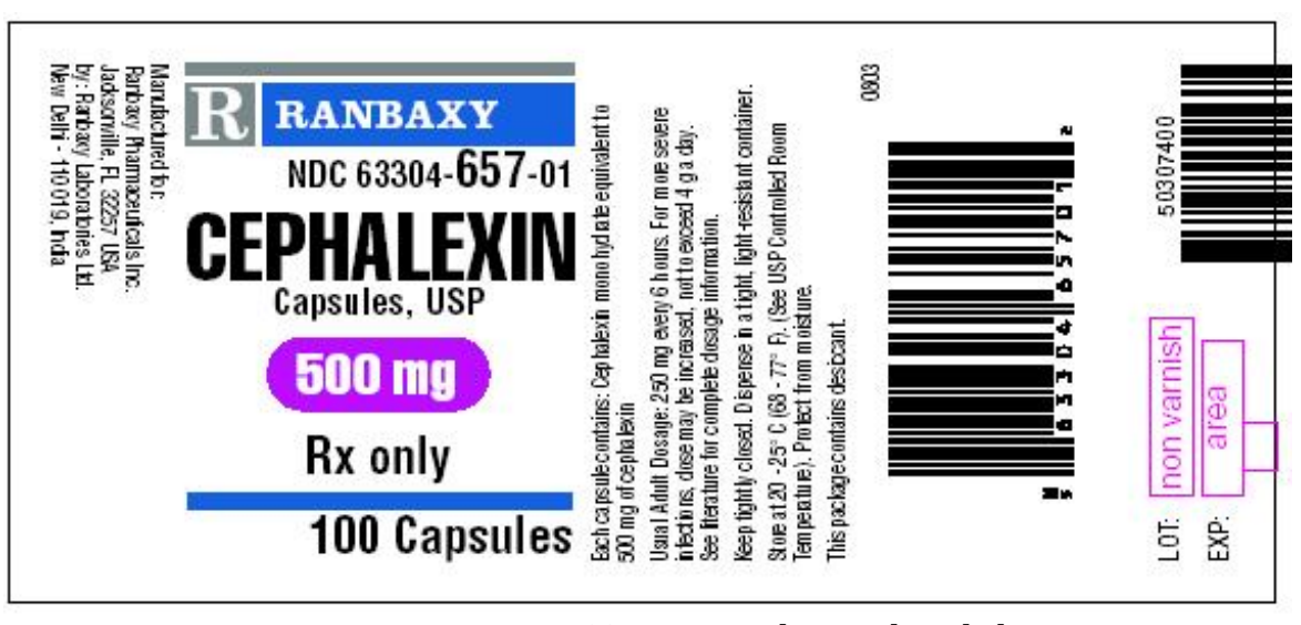
500 mg Capsules Bottle Label