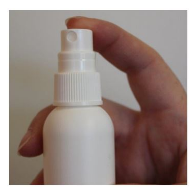
Step 3: Spray only enough SERNIVO Spray to cover the affected area, for example, the elbow ( See Figure C ). Rub in SERNIVO Spray gently.