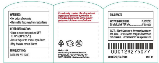
Panel 3 (Page 5)