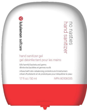
FRONT VISUAL ONLY