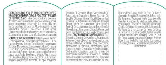
Panel 1 (Page 2)