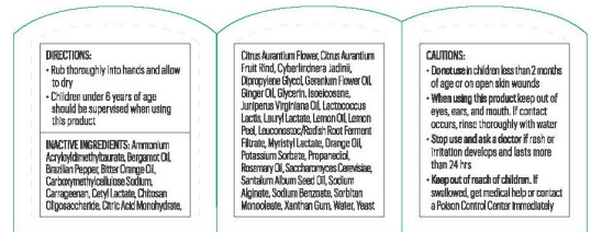
Panel 1 (Page 2)