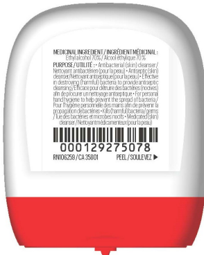
BACK VISUAL ONLY