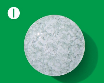
치약 한 알을 입안에 넣고 Pop one tablet in mouth

Refresh your teeth twice daily with O-Bits. Xylitol Toothpaste, the complete anti-cavity formula from nature. Double action anti-cavity with Finnish xylitol and German fluoride.