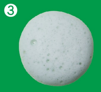
거품을 만들어 양치합니다. Brush teeth as it foams up