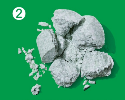
충분히 씹어 가루를 녹인 후 Chew thoroughly until dissolved