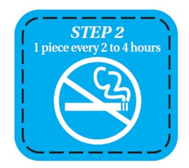
At the Beginning of Week #7