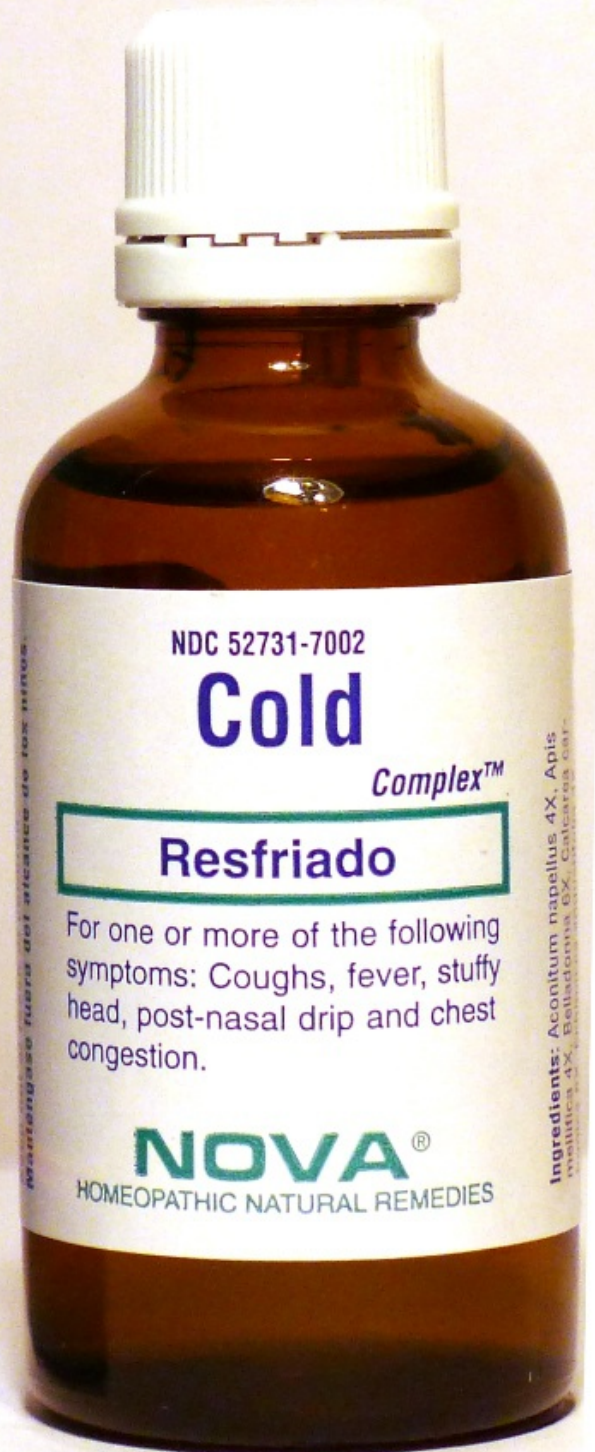
Cold Complex Bottle Label