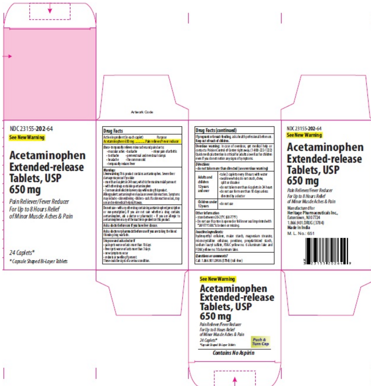
PACKAGE LABEL.PRINCIPAL DISPLAY PANEL 24 Caplets Label