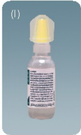
Bottle as you receive it