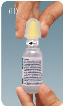
Snap off the dust cover by turning it clockwise to break the seal