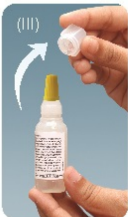
Pull off the dust cover