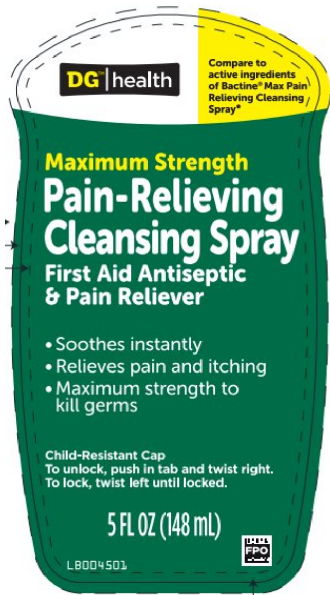
Principal Display Panel