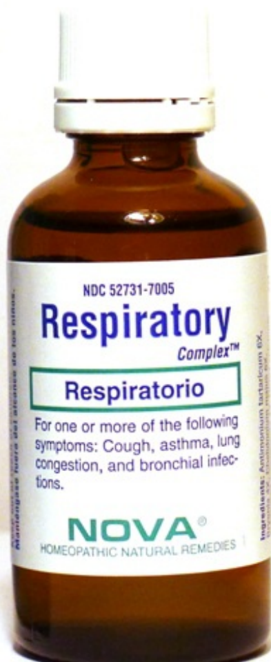
Respiratory Complex Bottle Label