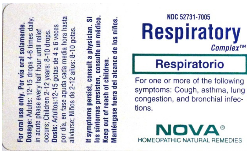
Respiratory Complex Box

Ingredients: Antimonium tartaricum 6X, Bryonia 4X, Chelidonium majus 6X, Echinacea angustifolia 4X, Hepar sulphuris calcareum 8X, Hepatica tribola 4X, Lycopodium clavatum 6X, Phosphorus 12X, Stannum metallicum 8X, Sticta pulmonaria 4X, 20% USP Alcohol, a.a. Manufactured by Nova Homeopathic Therapeutics Inc., Albuquerque, NM USA 87109. 1-800-225-8094 - www.novahomeopathic.com Bottle and Closure made in Germany