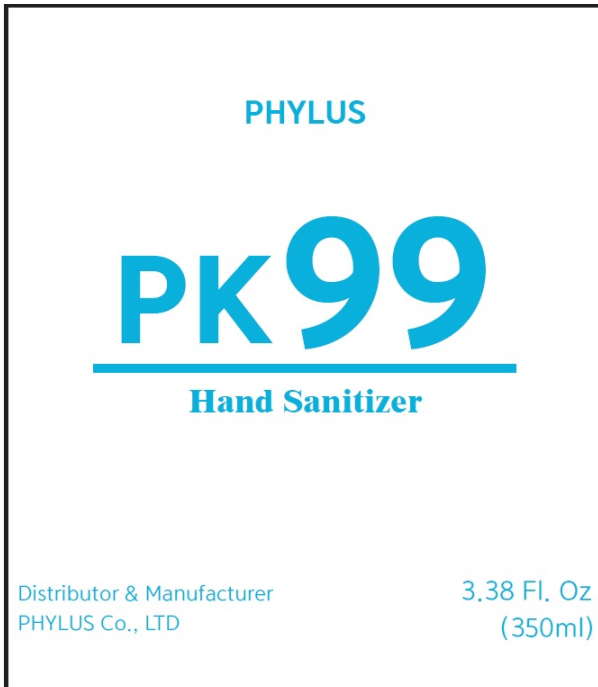
Package Label: PK-99 Hand Sanitizer 350mL