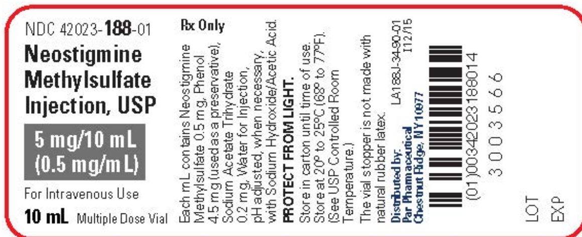
5 mg/10 mL (0.5 mg/mL) vial label