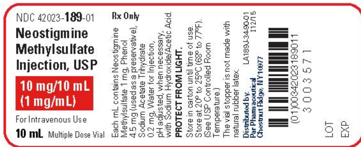
10 mg/10 mL (1 mg/mL) vial label