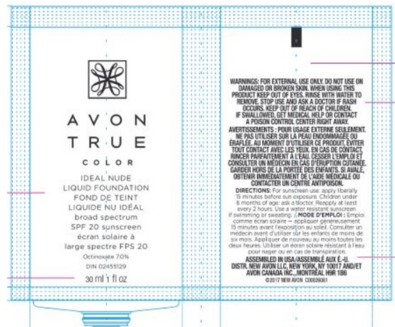
TRUE COLOR IDEAL NUDE MATTE FOUNDATION SPF20 true color ideal nude matte foundation spf20 lotion