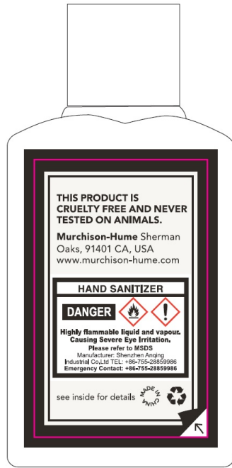
BACK PEEL AND REVEAL