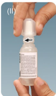
Snap off the dust cover by turning it clockwise to break the seal