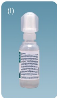
Bottle as you receive it