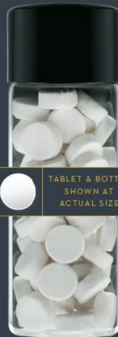
TABLET & BOTTLE SHOWN AT ACTUAL SIZE

68 SUBLINGUAL TABLETS INCLUDES TWO 4-TABLET SACHETS