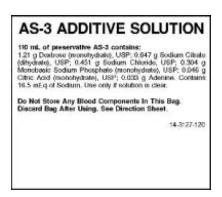
Additive Bag Label