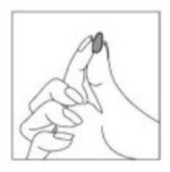
Step 3: Select the best position for vaginal insertion that is most comfortable for you to put in the IMVEXXY insert. See Figure C for suggested insertion in the lying down position or Figure D for suggested insertion in the standing position. With the smaller end up, put the insert about two inches into your vagina using your finger.