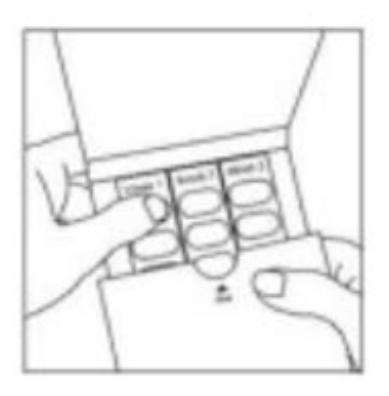
Step 2: Hold the IMVEXXY insert with the larger end between your fingers.