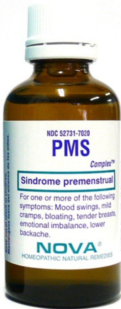
PMS Complex Bottle Label