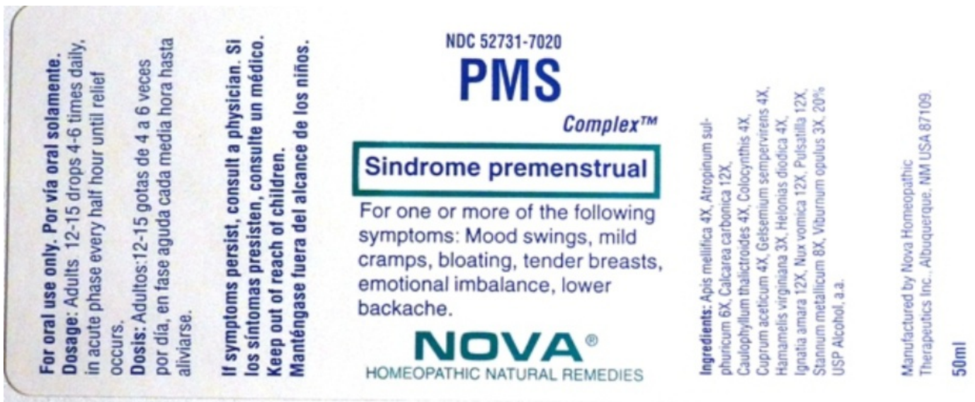
PMS Complex Box