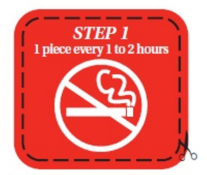
At the Beginning of Week #1 (Quit Date)