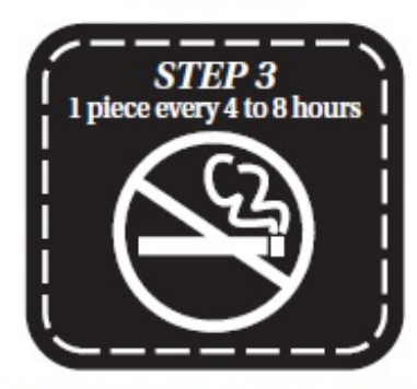
At the Beginning of Week #10