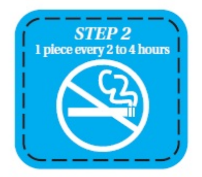
At the Beginning of Week #7

If you smoke your first cigarette WITHIN 30 MINUTES of waking up, use Nicotine Polacrilex Gum, 4 mg