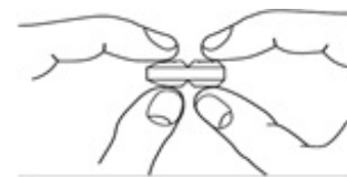
two-thirds tablet side