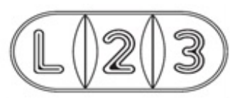
(scored lines) full tablet top view