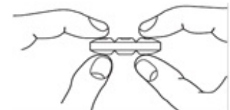
full tablet side view (with thumb and