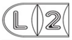
two-thirds tablet top view