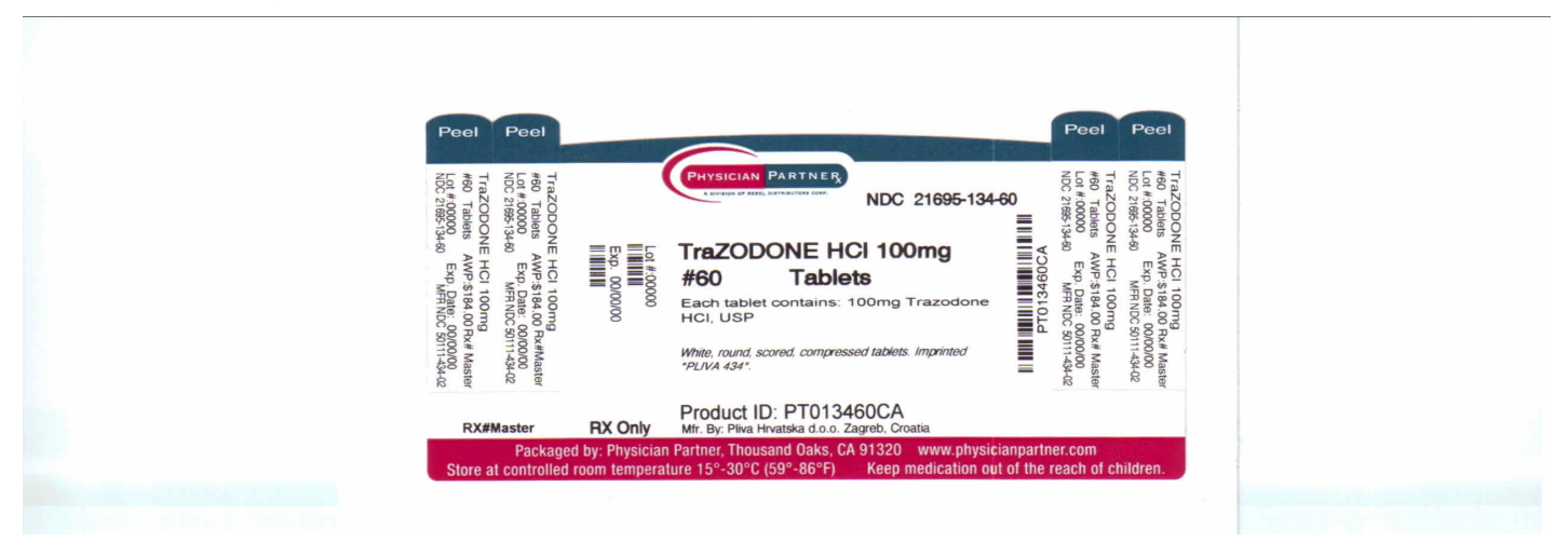
Principal Display Panel