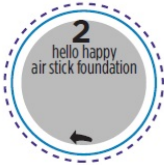
PAGE 1 ( FRONT )