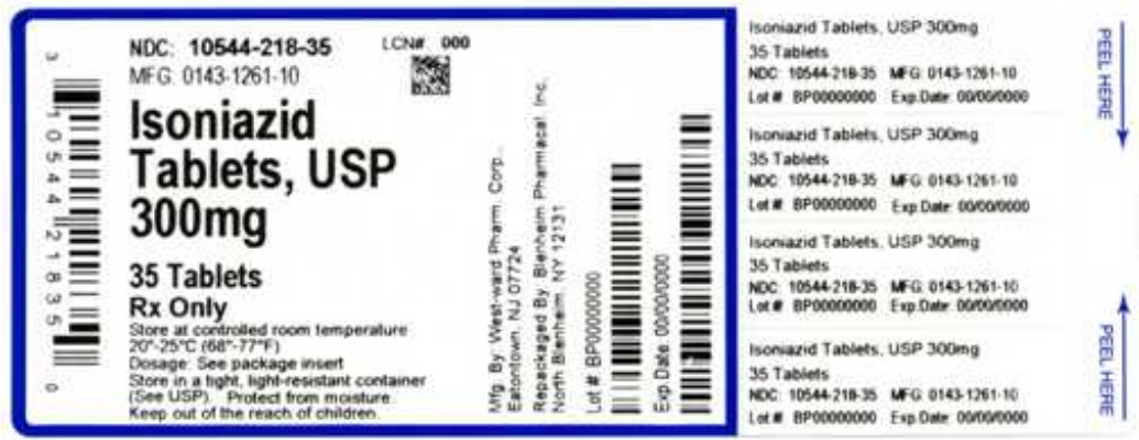
10544-218-35 Bottle Label