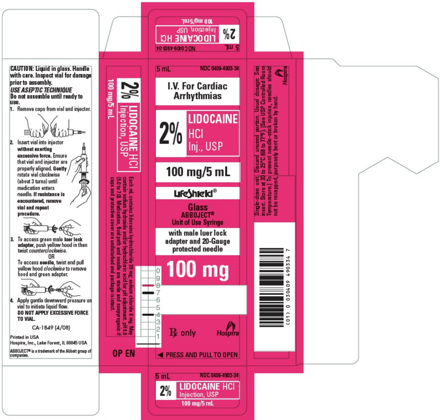
Principle Display Panel, 5mL Syringe Label