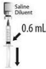
Figure 1. Cleanse both vial stoppers. Withdraw 0.6 mL of saline diluent from accompanying vial.

HIBERIX is to be reconstituted only with the accompanying saline diluent. The reconstituted vaccine should be a clear and colorless solution. Parenteral drug products should be inspected visually for particulate matter and discoloration prior to administration, whenever solution and container permit. If either of these conditions exists, the vaccine should not be administered.