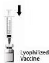
Figure 2. Transfer 0.6 mL saline diluent into lyophilized vaccine vial.