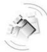
Figure 3. Shake the vial well.