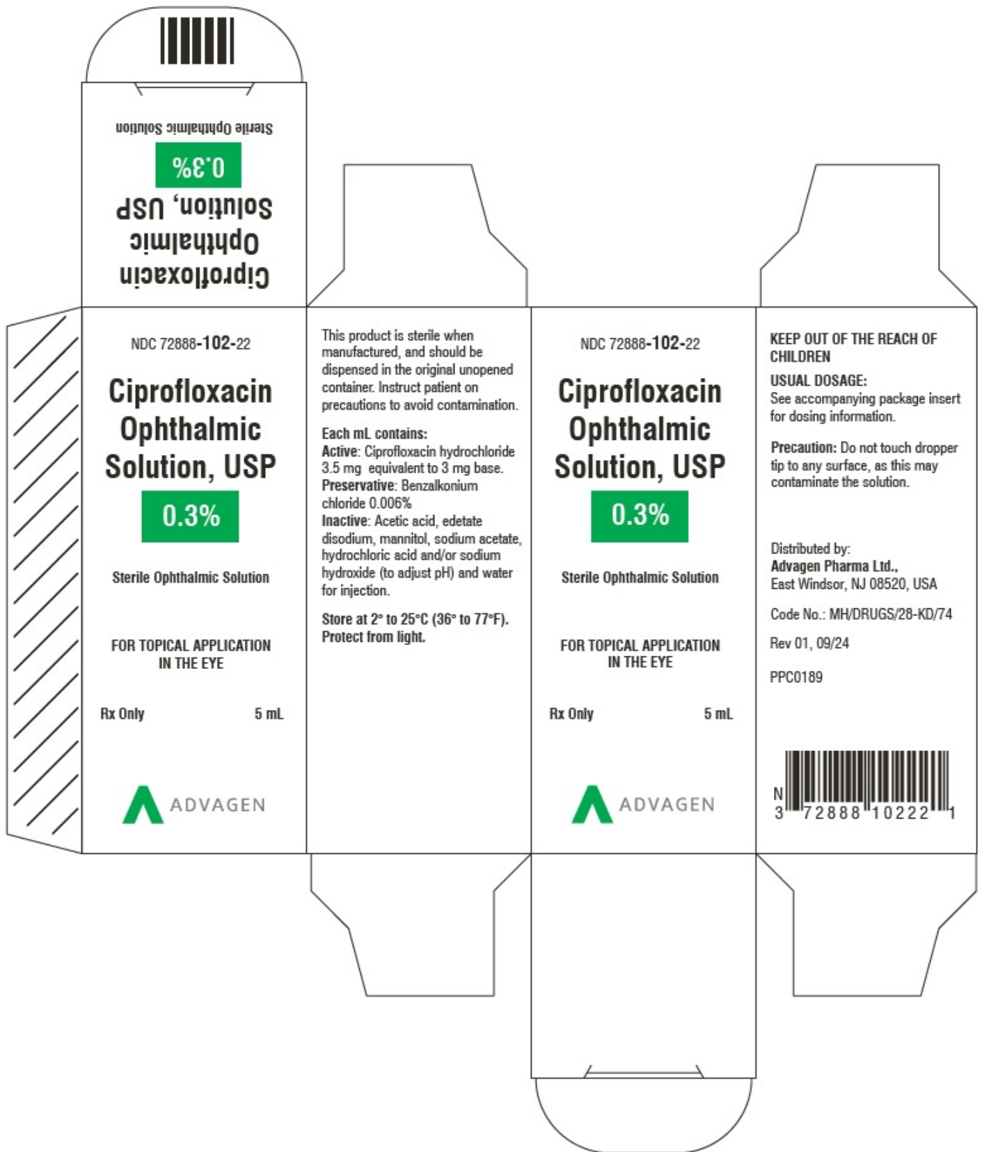
Ciprofloxacin Ophthalmic Solution, 0.3% - NDC 72888-102-22 - 5 mL Container