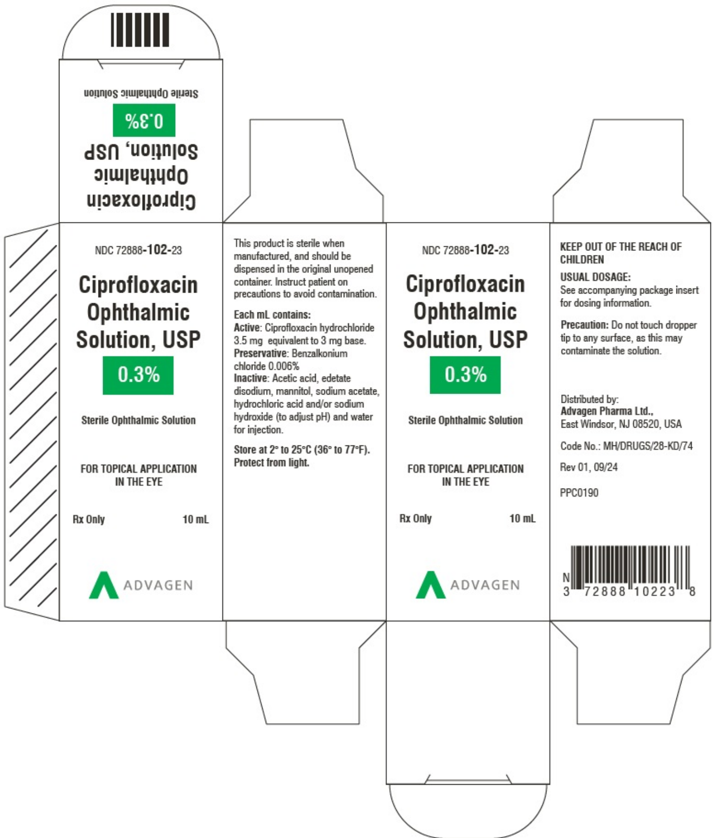
Ciprofloxacin Ophthalmic Solution, 0.3% - NDC 72888-102-23 - 10 mL Container