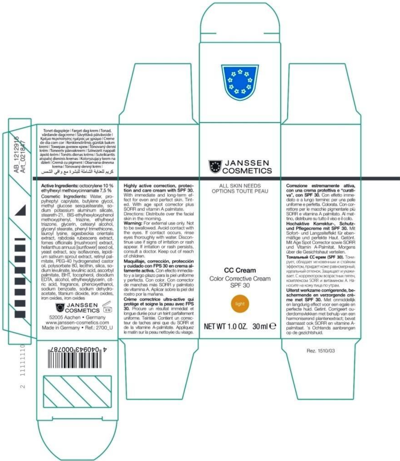
Front Panel of Box