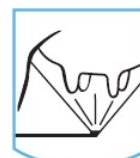
Teat Spray Roceador de tetina