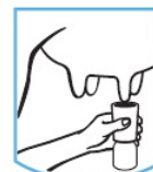
Teat Dip Baño de tetina

Read other label for directions for use, first aid and precautionary statements Lea la otra etiqueta para direcciones de uso, primeros auxilios y medidas preventivas