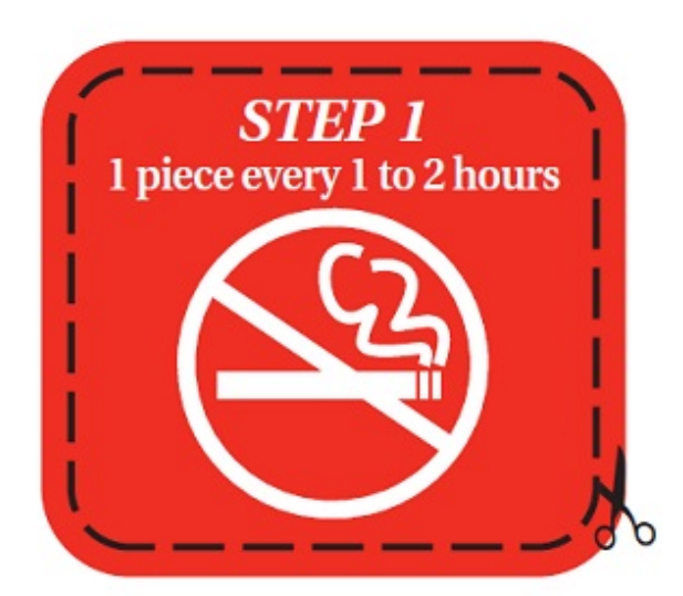
At the Beginning of Week #1 (Quit Date)