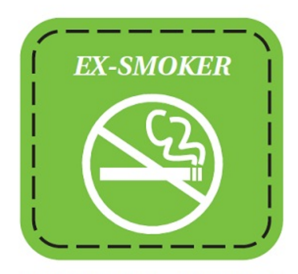
12 Weeks After Quit Date