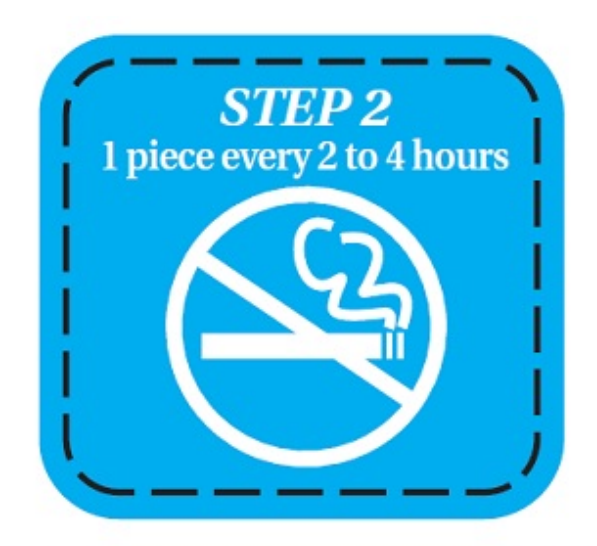
At the Beginning of Week #7

If you smoke your first cigarette MORE THAN 30 MINUTES after waking up, use Nicotine Polacrilex Gum, 2mg