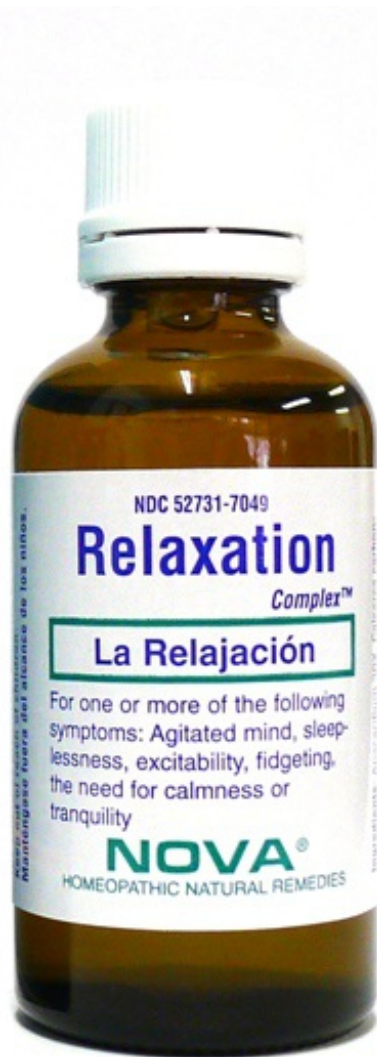
Relaxation Complex Bottle Label