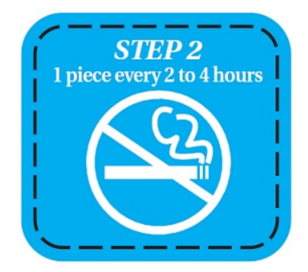
At the Beginning of Week #7