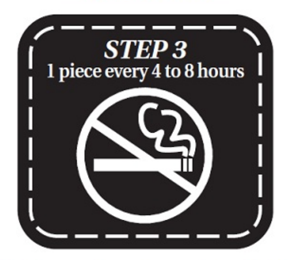
At the Beginning of Week #10