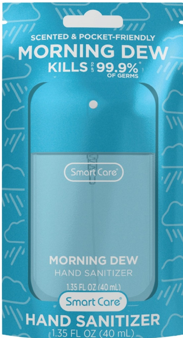
Inner Package Label