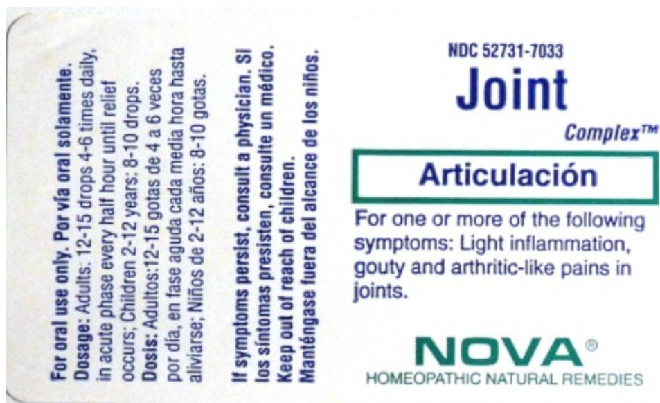
Joint Complex Box

Ingredients: Aconitum napellus 6X, Byrronia 4X, Colchicum autumnale 6X, Colocynthis 6X, Dulcamara 6X, Echinacea angustifolia 2X, Formica rufa 4X, Ledum palustre 4X, Rhus toxicodendron 10X, Ruta graveolens 4X, Silicea 8X, Sticta pulmonaria 4X, 20% USP Alcohol, a.a.