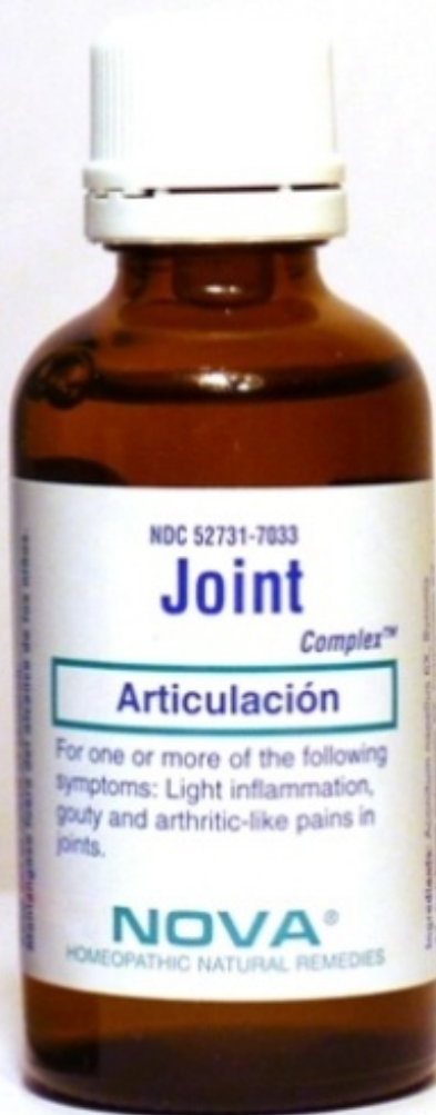
Joint Complex Bottle Label