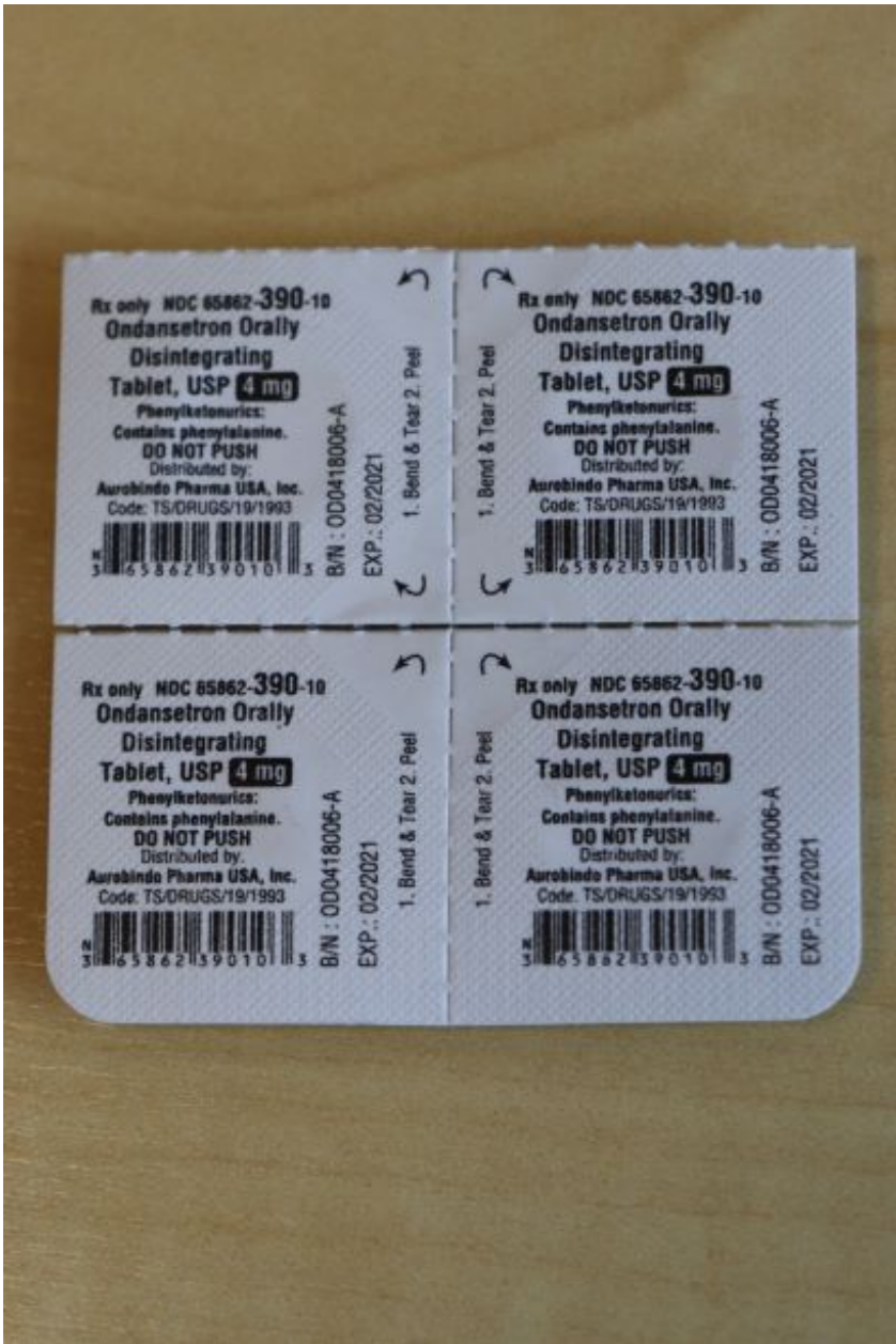
PRINCIPAL DISPLAY PANEL - Serialized bag