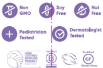
made of Sunscreen Lotion SPF30 Box

Other information Store at temperatures below 90°F