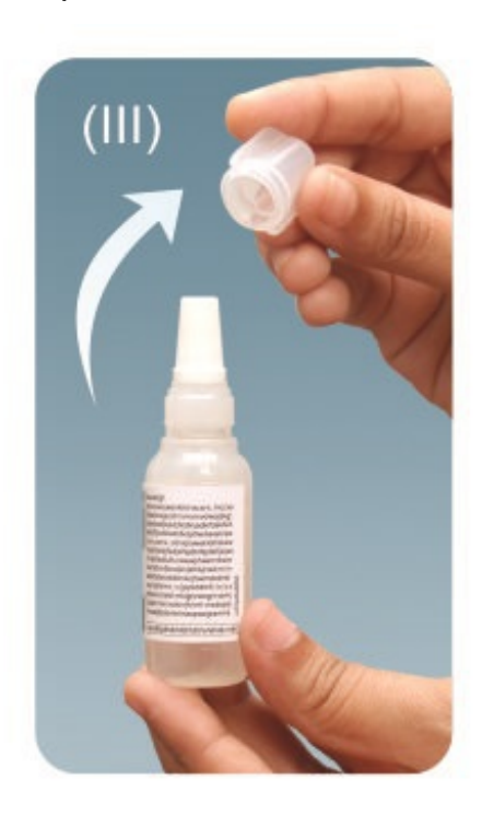
Step 3: Turn the tan coloured cap anti-clockwise and remove. Place the cap on a clean flat surface.