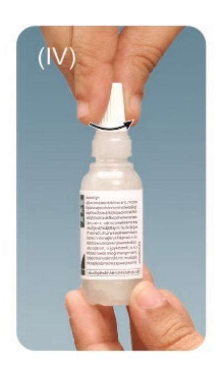
Step 4: Tilt your head backwards.