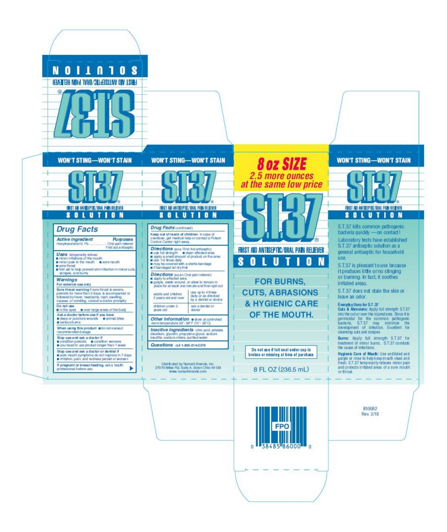
S.T.37<sup>®</sup> FIRST AID ANTISEPTIC/ORAL PAIN RELIEVER SOLUTION