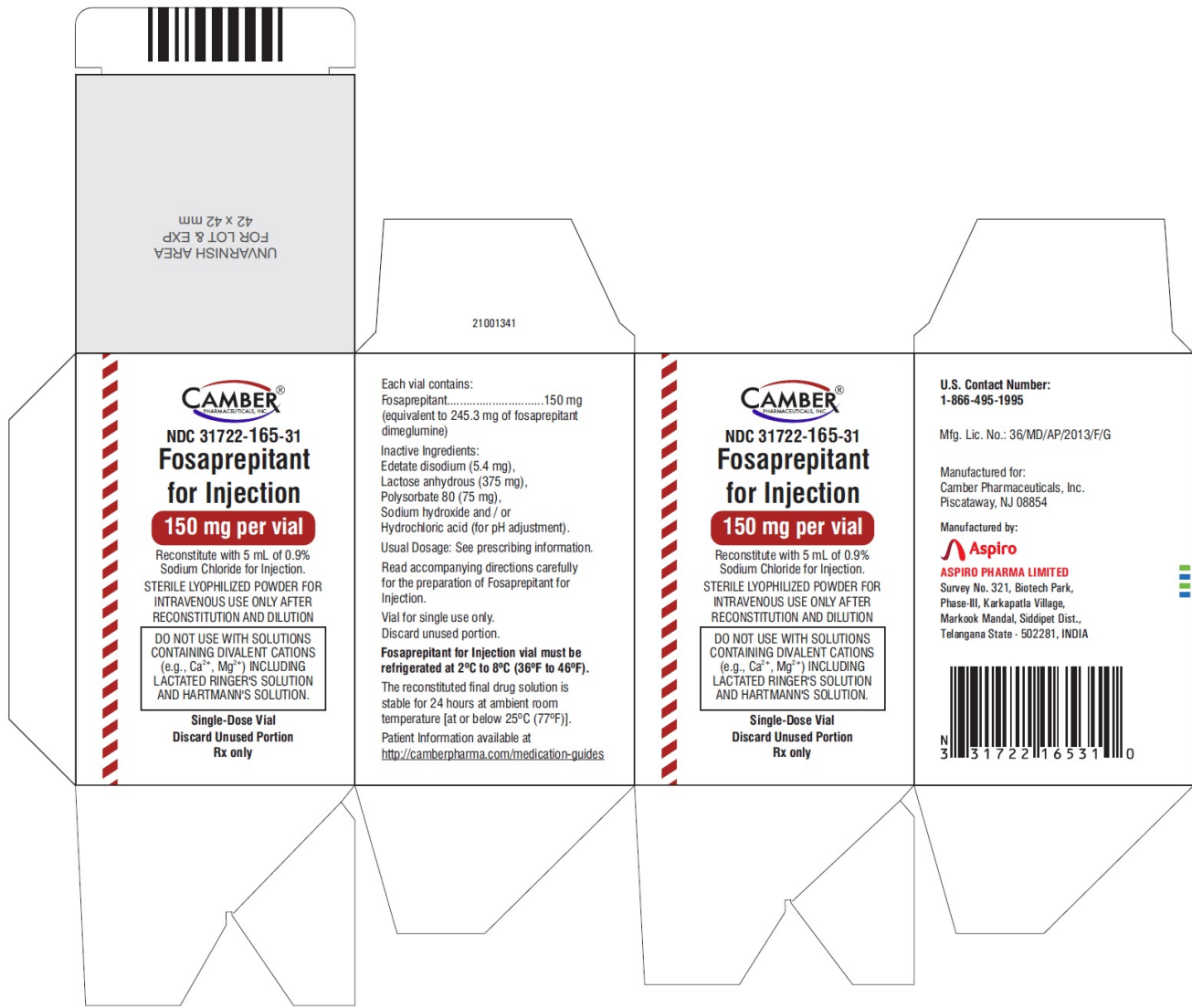
Fosoprepitant for Injection 150 mg per vial - Vial Label