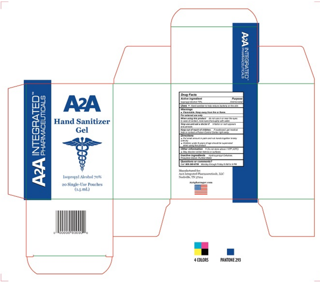
Label 1.5 mL