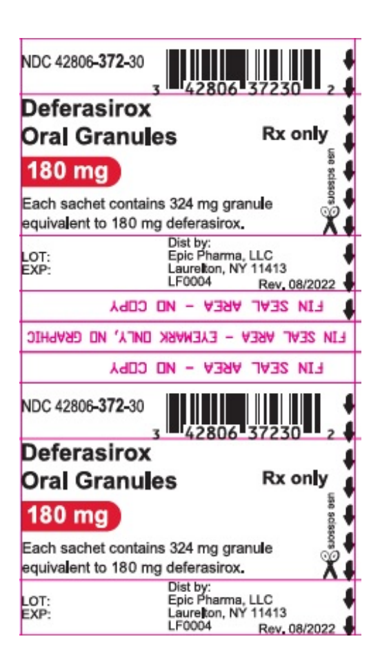
PACKAGE/LABEL PRINCIPAL DISPLAY PANEL - 180 mg Carton