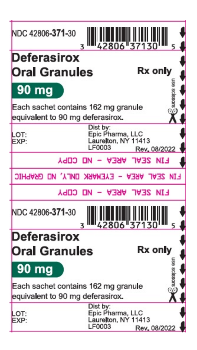
PACKAGE/LABEL PRINCIPAL DISPLAY PANEL - 90 mg Carton