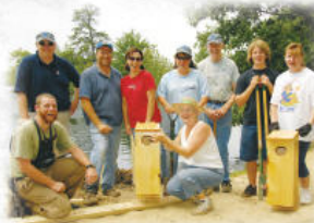
Tom's of Maine™ Goodness Day

5% (12 days) of employee time to volunteering. 10% of profits to human and environmental goodness.