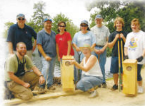
Tom's of Maine™ Goodness Day

5% (12 days) of employee time to volunteering. 10% of profits to human and environmental goodness.