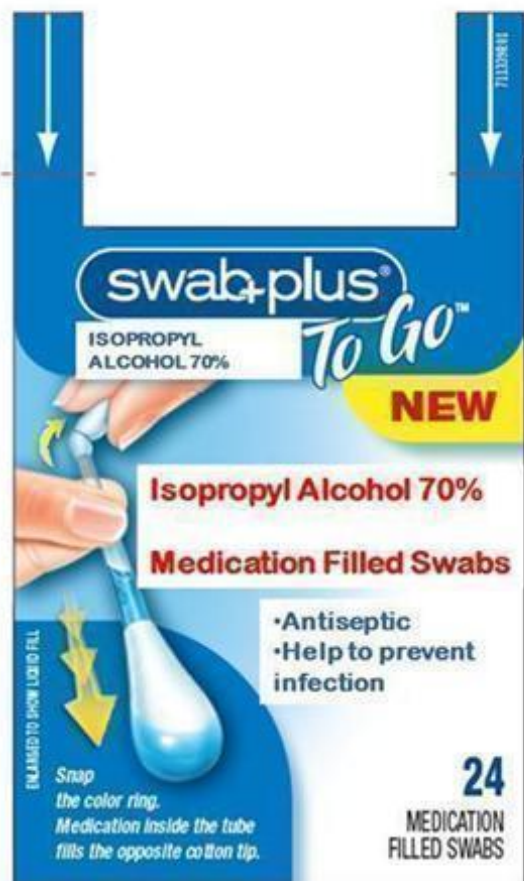
Image of Isopropyl Alcohol Label