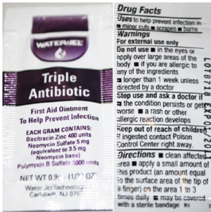
Burn Cream Label