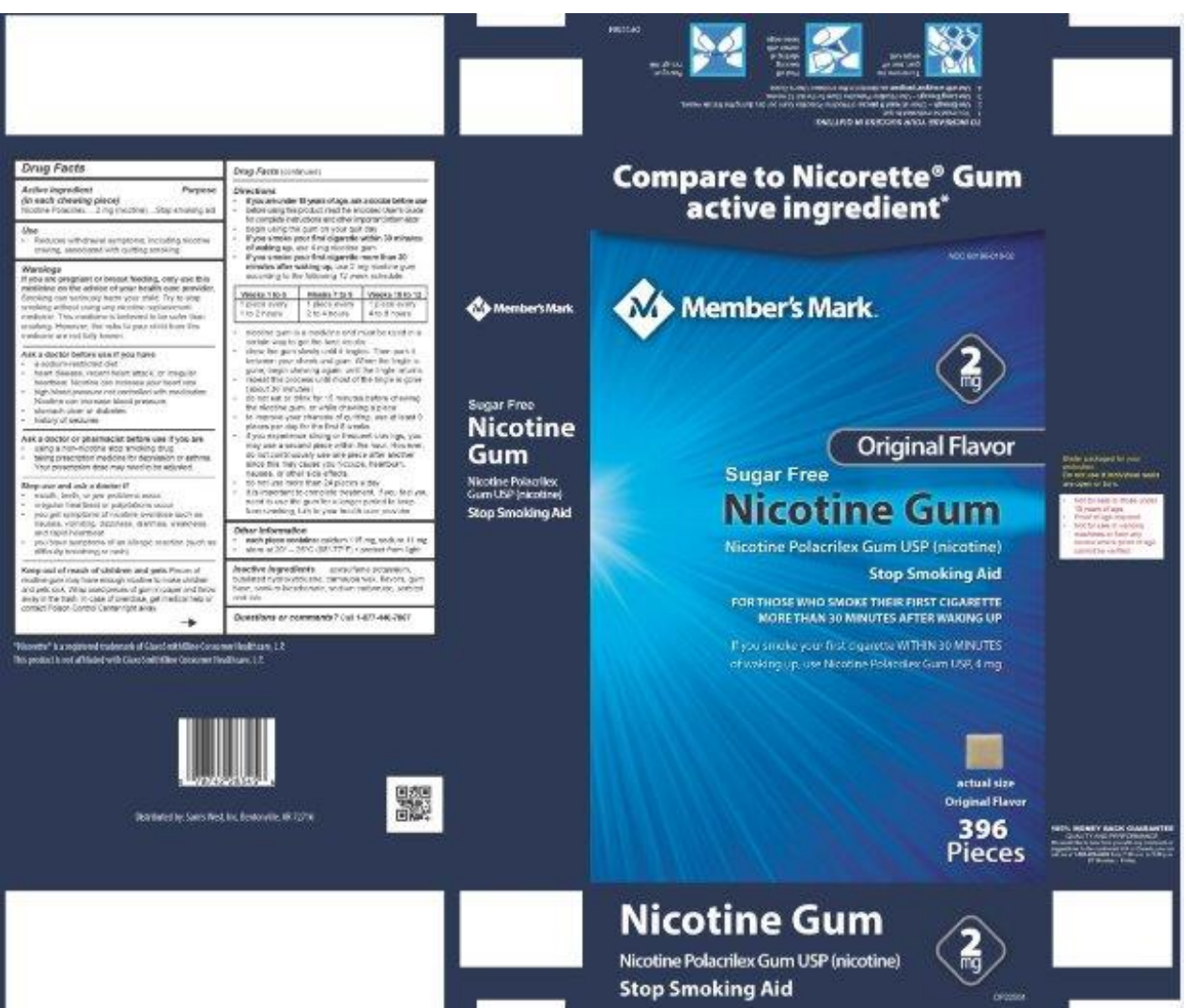
Nicotine Polacrilex Gum USP 2 mg Original DP22504