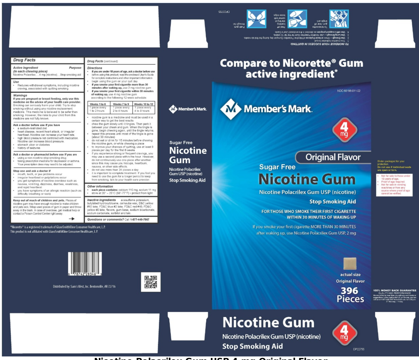
Nicotine Polacrilex Gum USP 4 mg Original Flavor