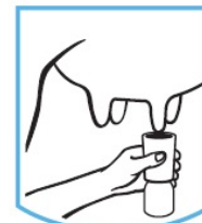
Teat Dip Baño de tetina

INFORMACIÓN DE EMERGENCIA SOBRE SALUD: 1 800 328 0026. Si está fuera de los Estados Unidos y Canadá, llame a cobro revertido al 1 651 222 5352 (número en los EE.UU.).