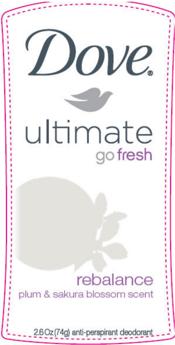
2.6 oz back PDP