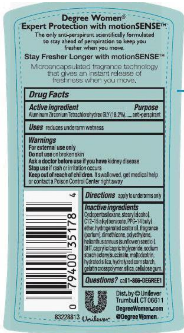
Degree 48 hour label