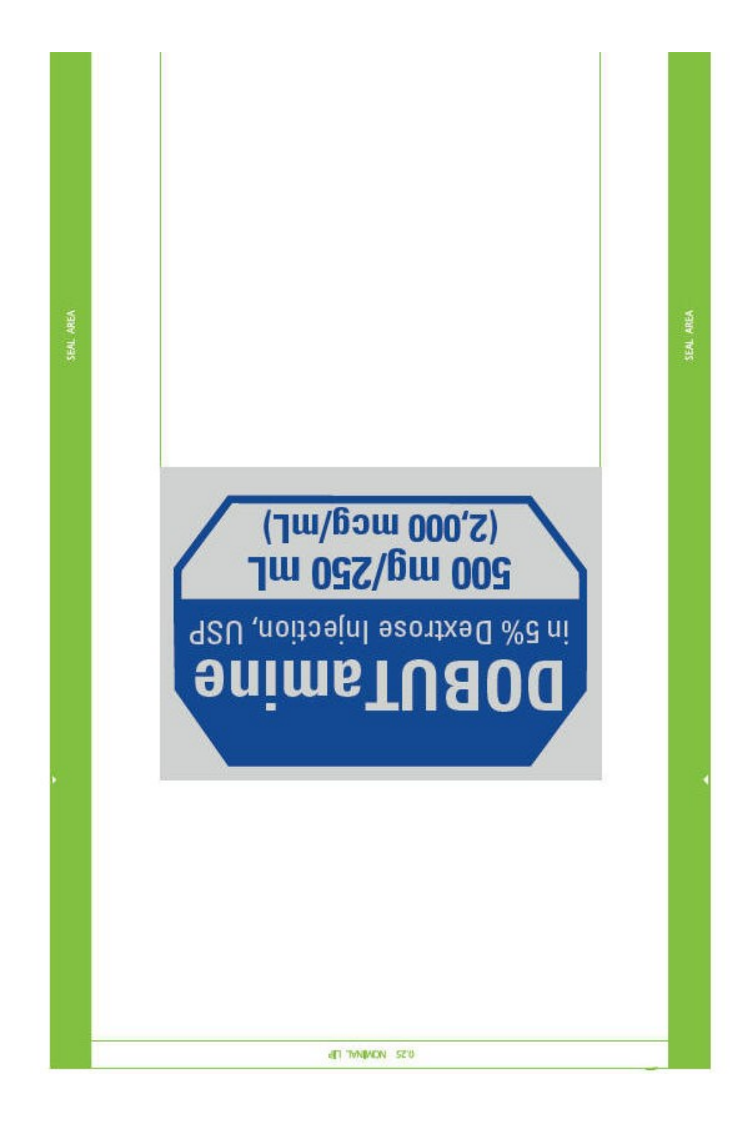
PRINCIPAL DISPLAY PANEL - SERIALIZED LABELING