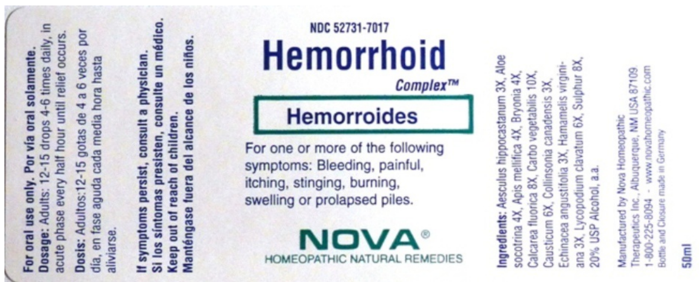
Hemorrhoid Complex Box